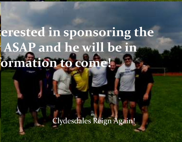
Clydesdales Reign Again!